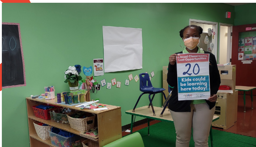
Child care providers are forced to shut down because they haven't been able to afford to hire qualified employees. This policy victory will help give child care workers the pay they deserve.