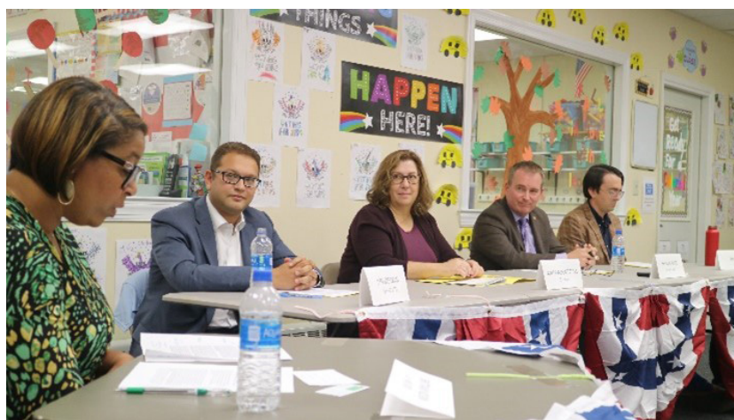
Legislative candidates in the Montgomery County Candidate Conversation