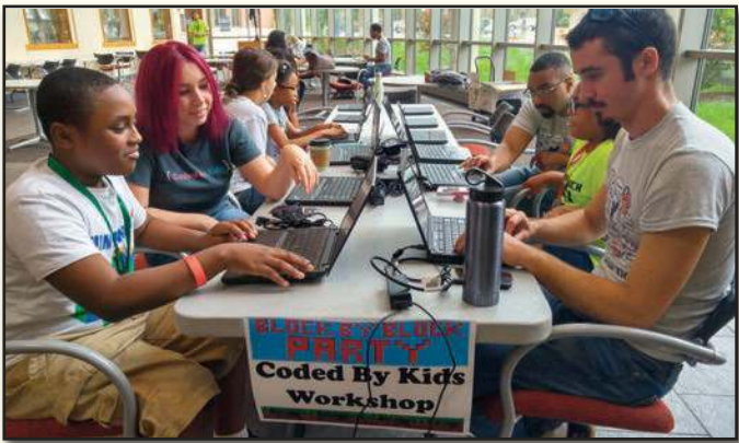
PCCY’s Block By Block Party engaged kids with a Minecraft marathon, STEM festival, and numerous popular activities, including a coding workshop hosted by Coded By Kids.

learning for students in need. PCCY is now replicating the success of our award-winning art grant program to champion scientific innovation and to further advance the national priority in STEM education.