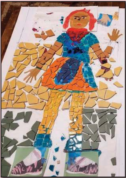
Artists at work! Picasso Project grant winners Barton Elementary’s “All Are Welcome Here” mosaic is coming together.