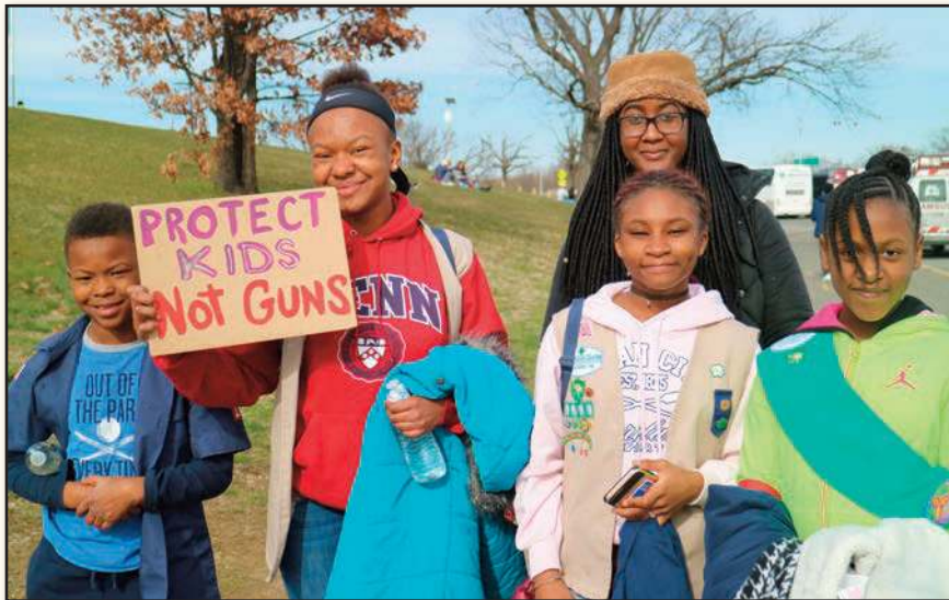
Philadelphia-area students arrive in D.C. to represent the region at March For Our Lives.

Our hearts were broken this Valentine's Day when a tragically ill young man entered a Parkland high school with the intent to kill. Fourteen teenagers and three staff lost their lives and scores of others lives will never be the same after witnessing the horror; yet the shooting happened in one of the safest schools in Florida that had two armed officers on school grounds.