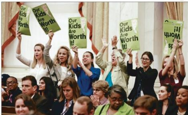
Supporters cheer City Council's passage of the levy on sugar-sweetened and diet drinks, a win for Mayor Kenney.

Phila.'s 15-cent per ounce levy on many drinks is the first such tax in a U.S. city. By Tricia L. Nadolny STAFF WRITER Looking to raise millions for a bold expansion of early childhood education, Philadelphia City Council on Thursday approved a 15-cent-per-ounce tax on sugar-sweetened and diet beverages, the first such tax imposed in a major U.S. city. The 13-4 vote put to bed months of speculation and at-times-bitter negotiations, but also ensured that the national spotlight will stay turned on Philadelphia for months, if not years. Critics quickly vowed a court challenge. And as the city introduces the unprecedented levy — and its economic and public-health effects come into view — experts, advocates, and legislators will surely be watching closely. Mayor Kenney, who can count this as the first major political victory of his term, called it a start to “changing the narrative of poverty in our city.” “It’s been generations we’ve been going downhill with our kids in our neighborhoods,” Kenney said. “And it’s going to take some time to get us back. But this is the first step back.” The tax will hit thousands of products — essentially anything bottled, canned, or from a fountain with either sugar or artificial sweetener. See SODA TAX on A12