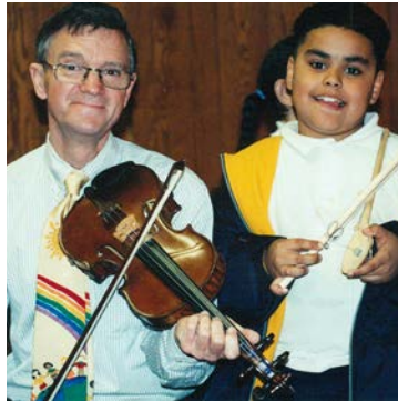
William Hunter Elementary