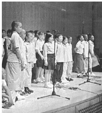
James Lowell Elementary

From 2005 to 2006, 19 schools received Picasso Project grants, and a series of “Friendraising” events helped to garner continuing support.