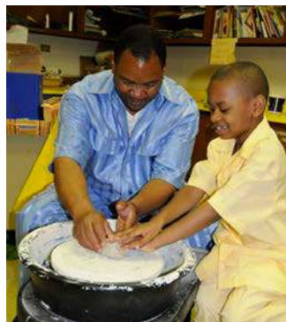
Samuel Daroff Elementary

In 2008 and 2009, Picasso Project funded 17 school-based arts projects , and released two reports that highlighted the urgent need for arts education funding to Philadelphia's schools: "Anchoring and Amplifying the Arts in Our Schools," and "Listen To My Story... Tell Me Yours."