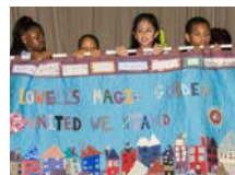
James Lowell Elem,