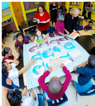
Thomas Mifflin Elementary

From 2010 to 2013, the Picasso Project funded 44 collaborative visual arts, dance, music, theater, and digital media projects. Through these projects, teachers and students, from grant recipient schools were mobilized to engage in strategic and coordinated arts advocacy campaigns.