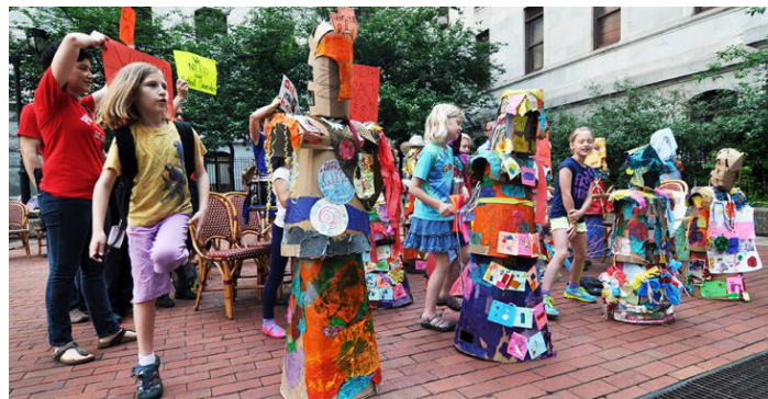
Samuel Powell Elementary

From 2010 to 2013, the Picasso Project funded 44 collaborative visual arts, dance, music, theater, and digital media projects. Through these projects, teachers and students, from grant recipient schools were mobilized to engage in strategic and coordinated arts advocacy campaigns.