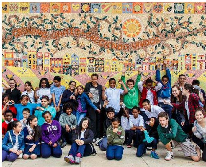
Alexander McClure Elementary