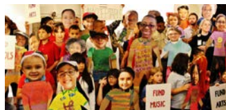
Allen Stearne Elementary

“McClure has been blessed the past three years as recipients of the Picasso Grant and we are so proud of the accomplishments of our community, staff, and students.”