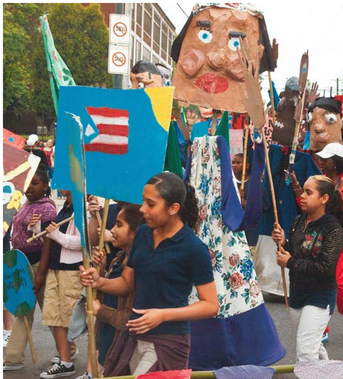
Feltonville Intermediate School