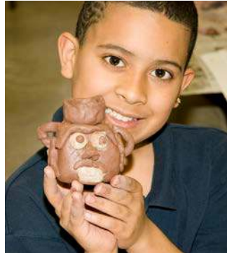
Sheridan West Academy

2007 brought increased recognition around the city of the need for supporting arts in public education, as well as an award from the Philadelphia Human Rights Commission .