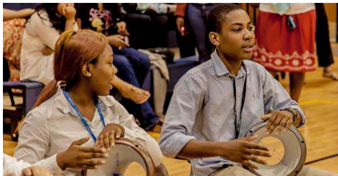
Motivation High School