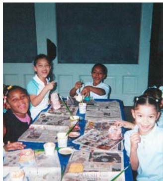
Feltonville Horn Elementary