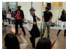
Fitter Academics Plus