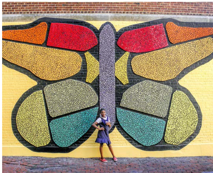
Alexander McClure Elementary