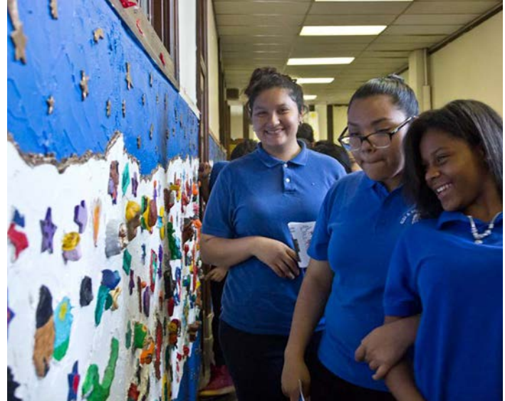
Eliza Kirkbride School