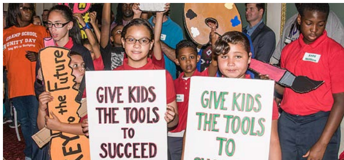
William Cramp Elementary