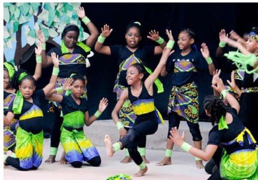
Global Leadership Academy

In 2008 and 2009, Picasso Project funded 17 school-based arts projects , and released two reports that highlighted the urgent need for arts education funding to Philadelphia's schools: "Anchoring and Amplifying the Arts in Our Schools," and "Listen To My Story... Tell Me Yours."