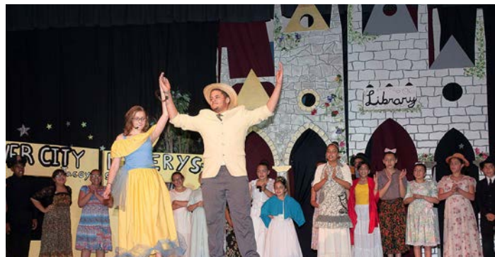
Eugenia Maria de Hostos Charter School