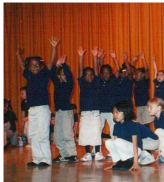
Robert Pollock Elementary