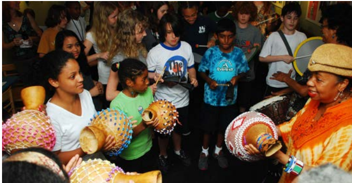
Penn Alexander School

In 2010, PCCY hosted a “Breaking Cultural Barriers Through the Arts” forum, bringing together students, educators artists, administrators, and advocates to explore arts education’s capacity to foster student understanding and respect.