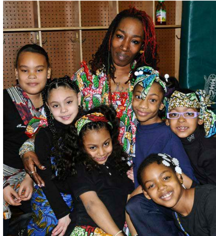
Alexander McClure Elementary