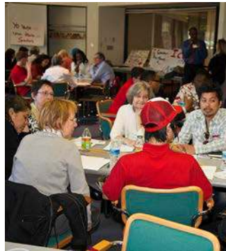
“Breaking Cultural Barriers” Forum

In 2010, PCCY hosted a “Breaking Cultural Barriers Through the Arts” forum, bringing together students, educators artists, administrators, and advocates to explore arts education’s capacity to foster student understanding and respect.