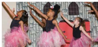
Thomas Mifflin Elementary