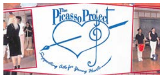
Original Picasso Project logo

From 2005 to 2006, 19 schools received Picasso Project grants, and a series of “Friendraising” events helped to garner continuing support.