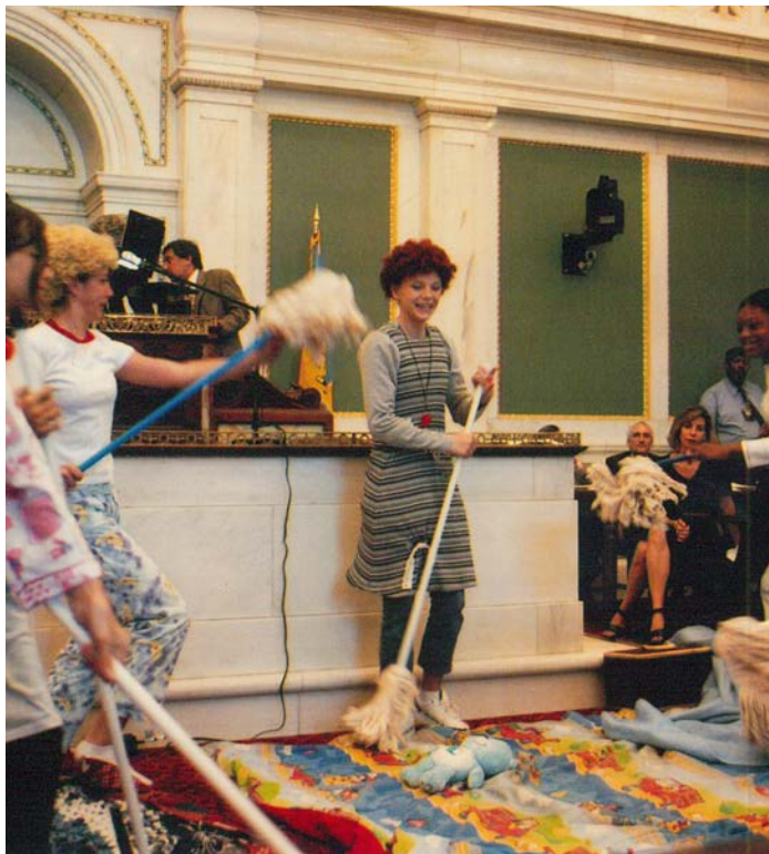
Austin Meehan Middle School students performing "Annie" in City Council chambers

Picasso Project's impact grew in its second year, awarding grants to 13 schools . PCCY raised awareness among political leaders of the importance of the arts in education. Due to PCCY's advocacy efforts, Philadelphia City Council passed a resolution for "Arts In Education Day," celebrated with student performances in council chambers.