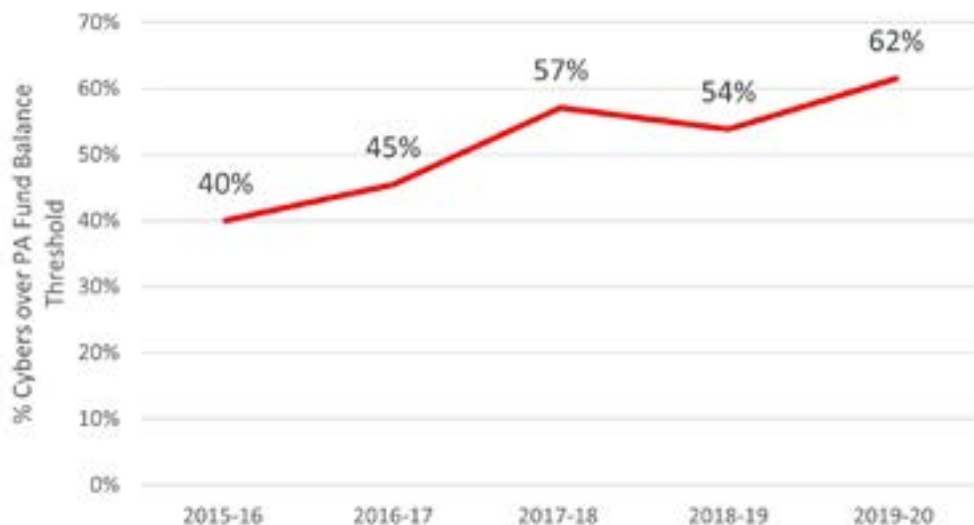
Chart 3: Share of Cybers With Fund Balances Exceeding the PA Threshold Trending Higher

Finally, Chart 3 below, shows a clear trend that the issue of excessive fund balances is becoming more widespread. As recently as the 2015-16 school year, 40 percent of cybers exceeded the threshold in the Pennsylvania School Code. By 2019-20, the share of cybers with excessive fund balances rose by more than half to 62 percent.